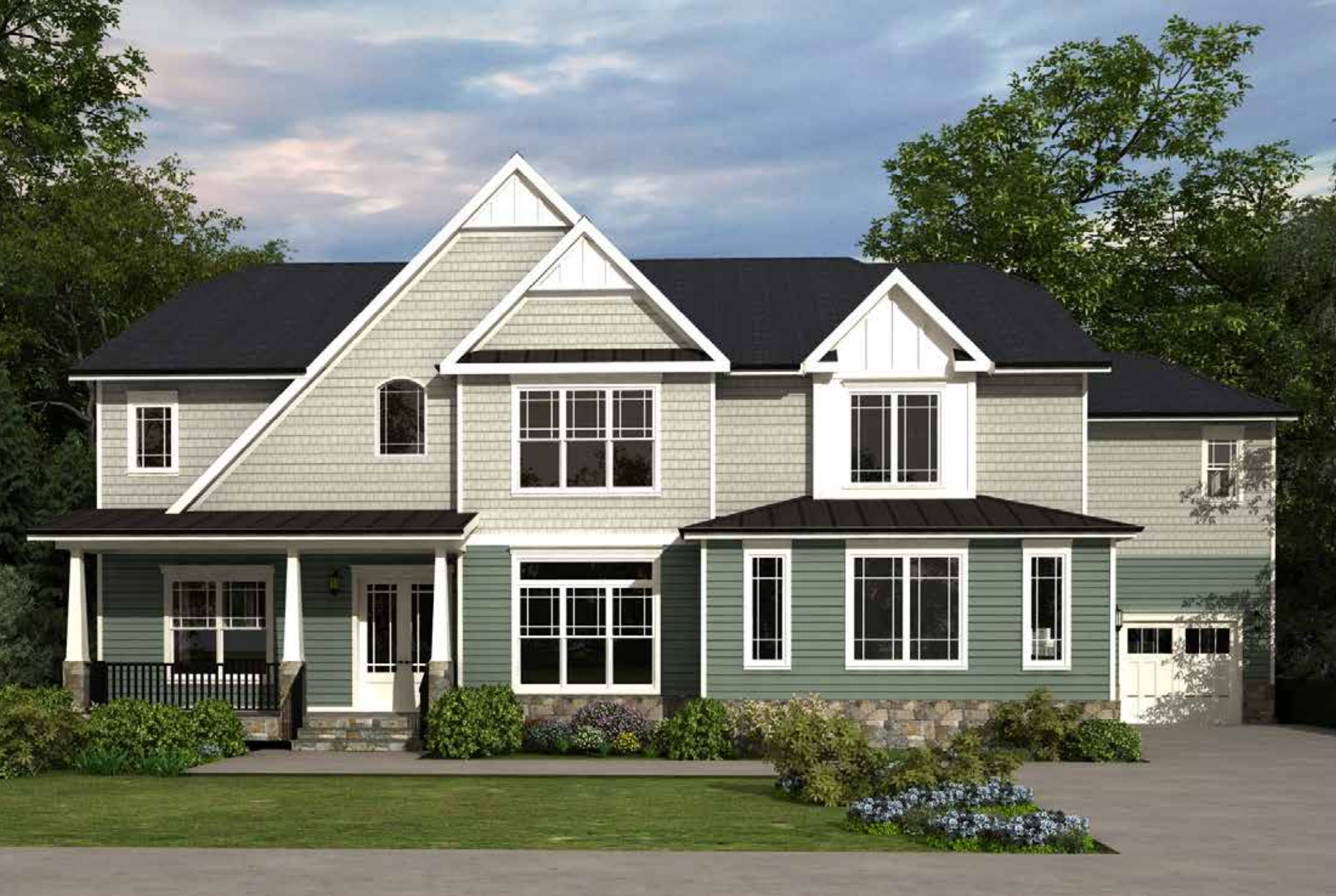
The Topaz Model