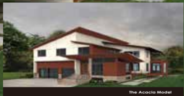
The Acacia Model